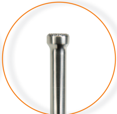
Round Graft Tamps