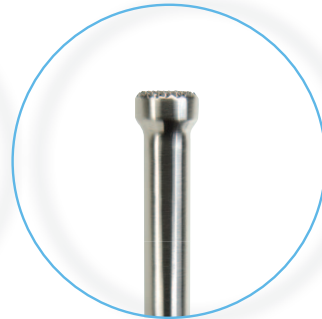
Round Graft Tamps